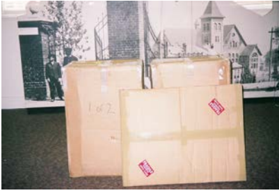
Opening boxes and setting up.